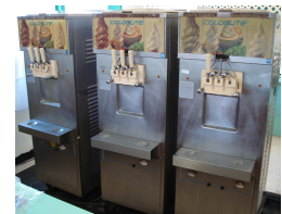
Soft Serve machines of all sizes

For the office. For the athletic league. For your apartment complex. For your corporate offices. You won't believe how much money you can save or make for your group.