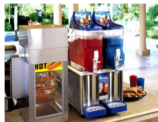
2-Flavor & Single Machines