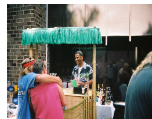
We have Tiki Bars & Inflatable kiosks

We have the perfect complementary products for big events: The best drinks make the best parties. The best caterers use us, and for the cost, the satisfaction level is high. Break up the old meeting room formula—show them you are creative, smart, and effective.