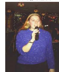
Karaoke Systmes can be used for public address